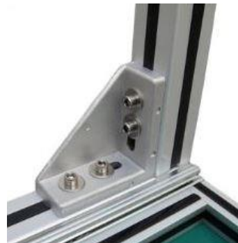
3. Big L-Bracket