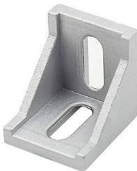
2. Small L-Bracket