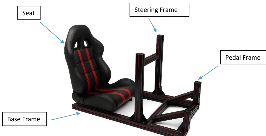
1. Full Sim Assembly